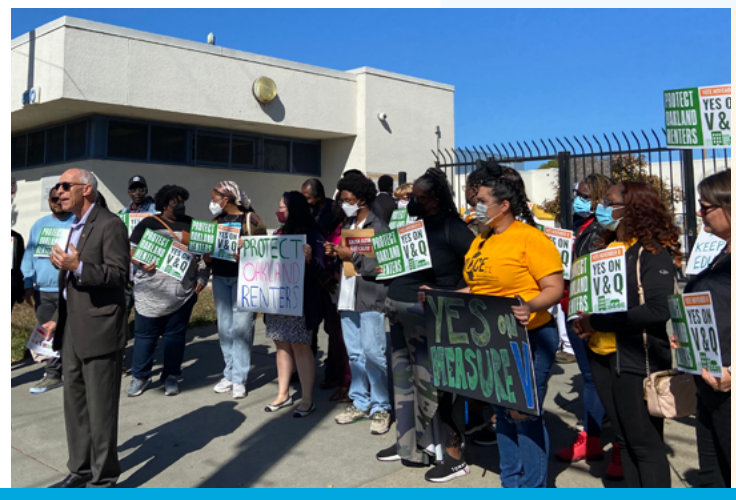
Oaklanders rally in support of expanding just cause eviction protections.

projects or categories of projects." This boilerplate language is included in all bond measures since market conditions always create some uncertainty about the amount of revenues that will be raised, but opponents took this sentence as evidence that the money would not in fact be spent on affordable housing and would lack sufficient oversight. By calling public attention to this language, the opposition confused voters and made them more hesitant to support the bond measure.