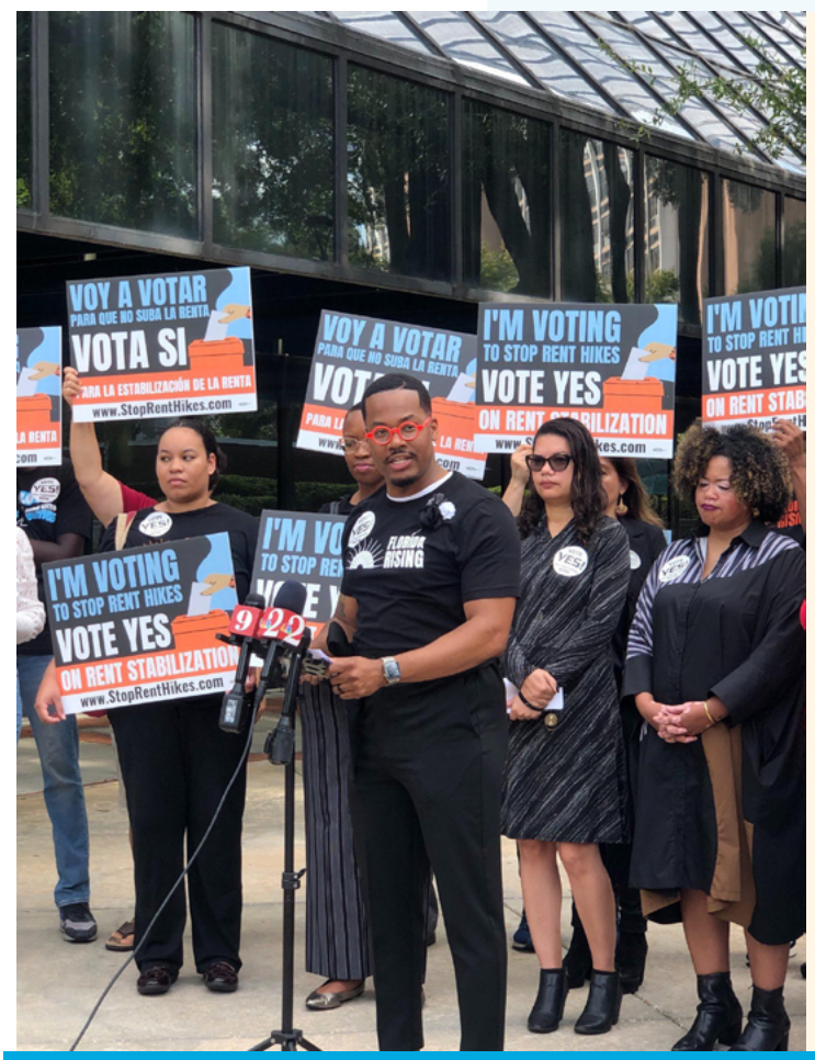
Organizers from Florida Rising and coalition partners show up in support of the ballot

"The election results illustrate the widespread popularity of rent stabilization – and its power to mobilize voters who may otherwise be apathetic or disengaged."