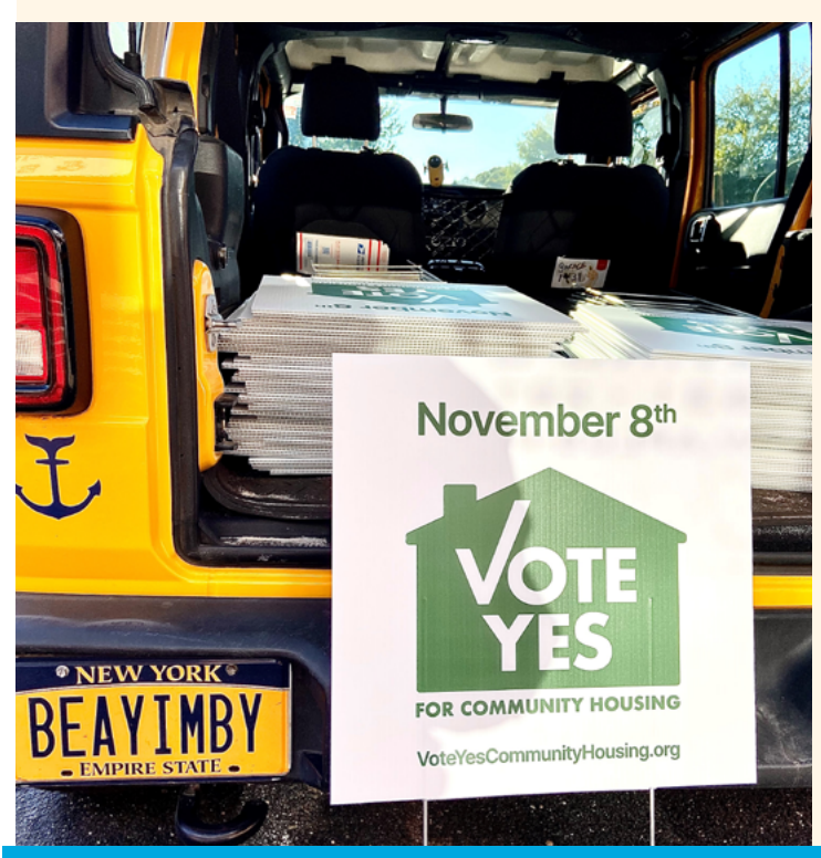
Vote Yes for Community Housing distributed lawn signs to residents and business owners.

Vote Yes for Community Housing elevated the stories of community members who were affected by housing cost-burdens and instability. In a small and tight-knit community where many residents know each other, it took a lot of courage for directly impacted individuals to share their stories. One grocer at the organic market, a well-known figure in the community, shared her experi-