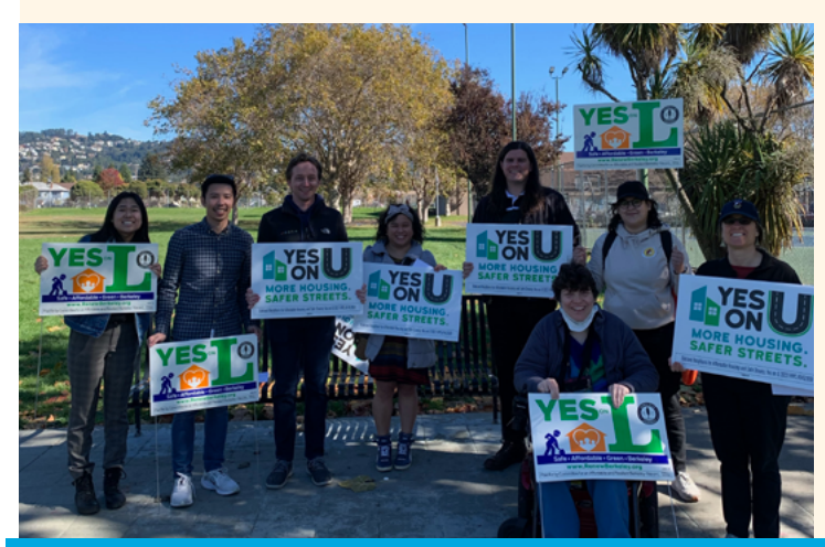
EBHO and NPH organized a joint canvassing session for bond measures in Berkeley

Voters in California's East Bay passed multiple ballot measures that will increase the supply of affordable homes and strengthen tenant protections. Oakland voters approved Measure V, which tightens the city's existing just cause eviction protections, and Measure U, a bond measure that dedicates $350 million to affordable housing. Berkeley voters passed Measure M, a tax on vacant homes. Each city also passed an Article 34 authorization (Measure Q in Oakland and Measure N in Berkeley), fulfilling a state constitutional requirement for voters to directly approve government-funded affordable homes. A majority of Berkeley voters supported a bond package, Measure L, that included $200 million for affordable housing, but the measure fell short of the 67% supermajority threshold required for passage. Organizers at East Bay Housing Organizations (EBHO), an affordable housing advocacy coalition, worked on both cities' housing measures and shared insights from their experiences.