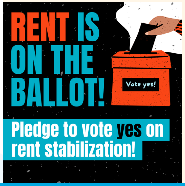
A campaign poster for the rent stabilization ballot measure

Voters in Orange County, FL, approved a ballot measure that would limit rent increases in multifamily apartment buildings to the rate of inflation for one year. (See page 3 for a detailed description of the ballot measure's provisions.) For Florida Rising, one of the key partners in the campaign, the push for rent stabilization emerged from the statewide Justice on Every Block campaign. The campaign seeks to create a state where everyone, regardless of what block they live on, can be safe, happy, healthy, and whole. Local People's Assemblies and leaders in 11 priority counties set the campaign's vision and policy goals. Housing justice is a central component of most of the counties' campaign platforms, and members across the state endorsed rent stabilization as a policy priority.