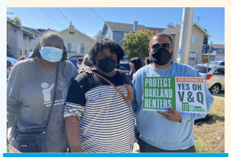
Organizers in Oakland ran a coordinated campaign for Measures V and Q.

Organizers in Oakland campaigned collaboratively for Measures Q and V, while the campaign for Measure U was a unique effort. The campaign for Measures Q and V primarily focused on Measure V and its groundbreaking just cause eviction protections. In Berkeley, the vacant homes campaign and the bond measure campaign were independent from each other, and there was not a significant campaign for Measure N (Article 34 authorization) because there was no organized opposition to it. Although each city had its own distinct set of ballot measures and campaigns, EBHO and Nonprofit Housing Association of Northern California (NPH) did organize a joint canvassing session for Measures L and U in the neighborhoods where Berkeley and Oakland meet.